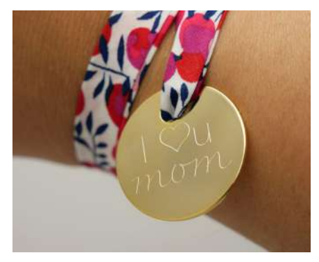
Personalizing and engraving jewelry