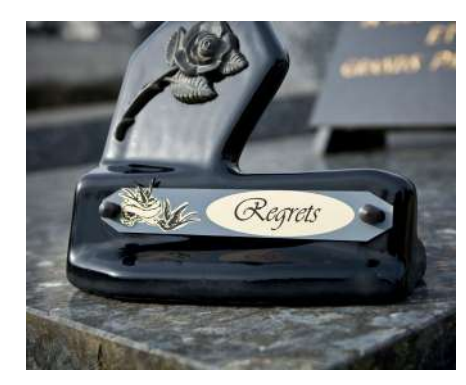
Funeral plaques and headstones engraving