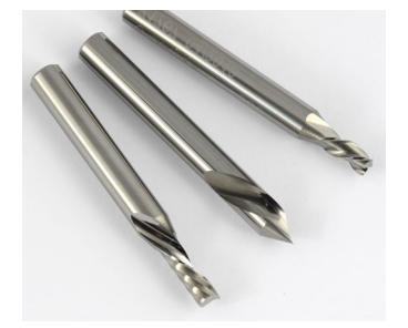
Designed to meet productivity Combines and endurance requirements. The range offers short tools for applications requiring a collet or high-frequency spindle.