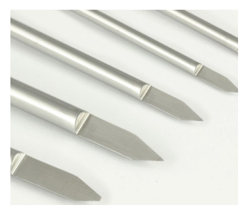
Offers cutters with steel or carbide tips, compatible with near all Gravotech machines.