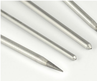
Combines delicacy and precision. They are compatible with scratch engraving projects, particularly on metals and glass. The Diamond range is divided into the Onecut and Twincut lines.