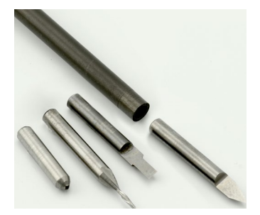
The Twincut solution (available in 4.36 mm) is the most versatile. The cutters in this range can be used with a single tool holder, and are interchangeable.