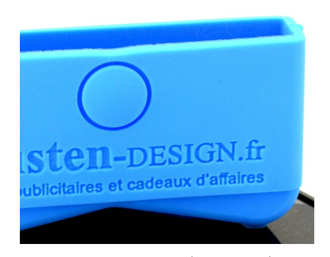
Non-contrasted marking on plastics