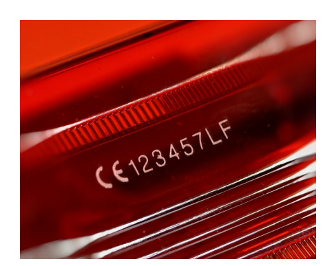
Glass & transparent plastics