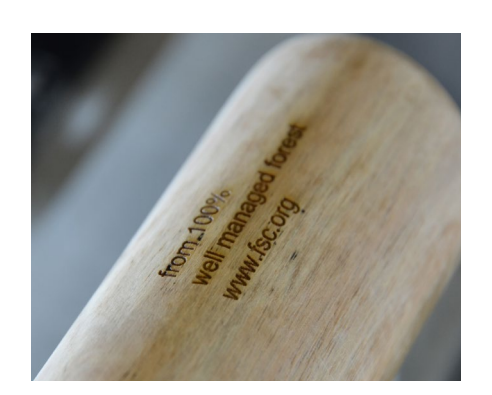
Marking on wood